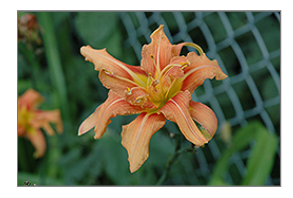
Kwanso Daylily flowers