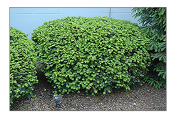
Densiformis Yew

This is a relatively low maintenance shrub, and can be pruned at anytime. It has no significant negative characteristics.