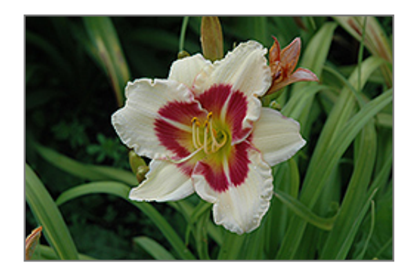
Todd Monroe Daylily flowers