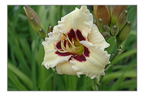
Siloam Ury Winniford Daylily flowers