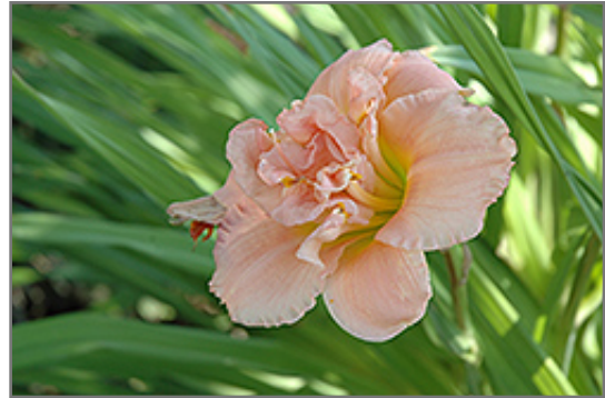
Siloam Double Delight Daylily flowers

Outstanding, large, double, tan blooms with gold eyezone and green throat; sturdy, strong, easy to care for, great grassy texture and form; good for the beginner gardener and the pro