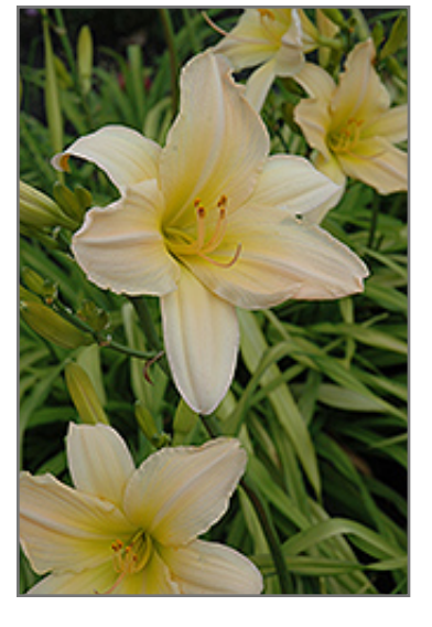
Satin Glass Daylily flowers

Miniature, butter colored trumpets lit with a bright yellow center and green throat; sturdy, strong, easy to care for, great grassy texture and form; good for the beginner gardener and the pro