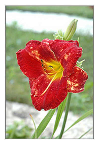
Red Poinsettia Daylily flowers

Miniature dark red, elongated, trumpets with yellow throat; sturdy, strong, easy to care for, great grassy texture and form; good for the beginner gardener and the pro