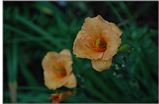
Pixie Parasol Daylily flowers

Miniature, reblooming, light peachy-pink trumpets lit with a golden halo; sturdy, strong, easy to care for, great grassy texture and form; good for the beginner gardener and the pro