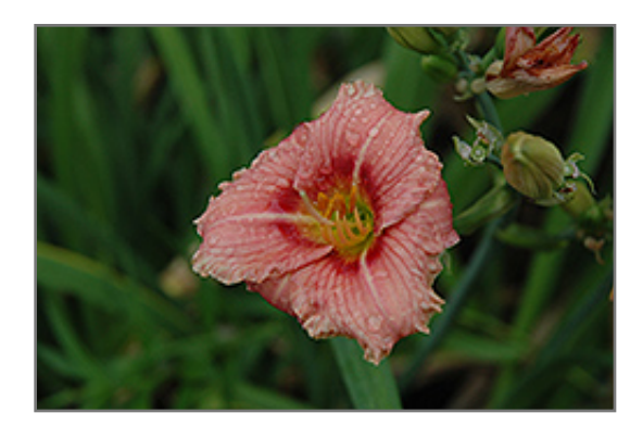
Siloam Bye Lo Daylily flowers