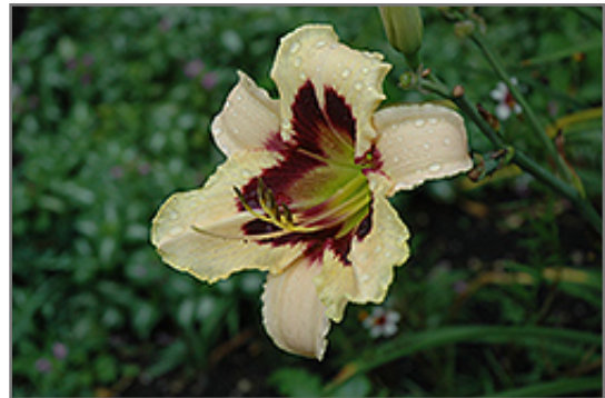
Moonlit Masquerade Daylily flowers

Reblooming, large, cream trumpets with dark purple band and yellow-green throat; sturdy, strong, easy to care for, great grassy texture and form; good for the beginner gardener and the pro