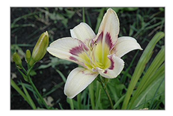
Mokan Butterfly Daylily flowers