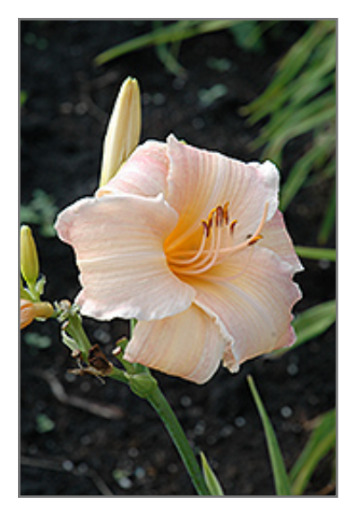
Luxury Lace Daylily flowers

Luxury Lace Daylily is recommended for the following landscape applications;