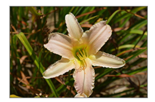
Luxury Lace Daylily flowers