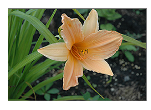
King's Grant Daylily flowers