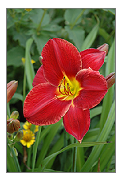
James Marsh Daylily flowers

Large, velvety red trumpets with yellow-green throat; sturdy, strong, easy to care for, great grassy texture and form; good for the beginner gardener and the pro