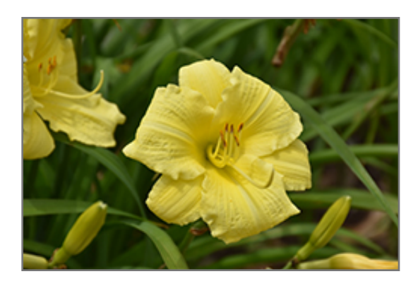
Rainbow Rhythm Going Bananas Daylily flowers