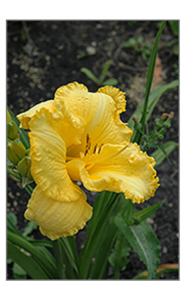
Fuss And Bother Daylily flowers

Bright gold trumpets with ruffled edge; sturdy, strong, easy to care for, great grassy texture and form; good for the beginner gardener and the