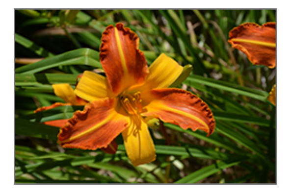
Frans Hals Daylily flowers