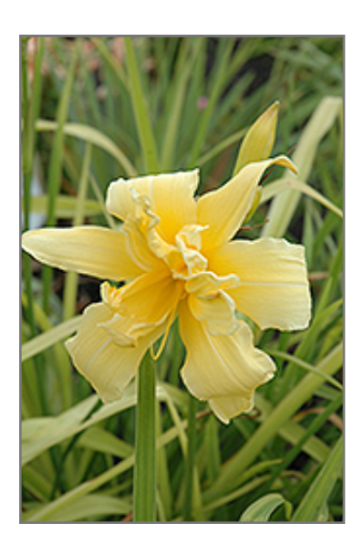
Floral Pattern Daylily flowers