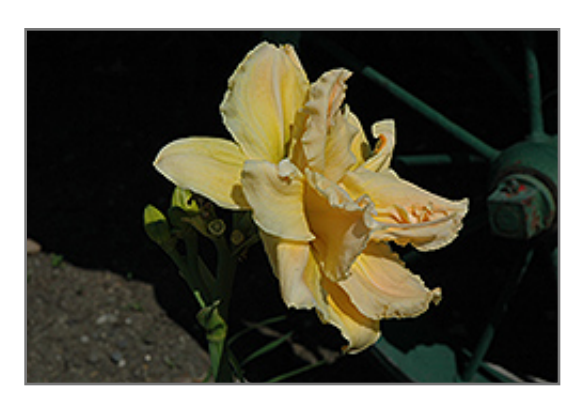
Double River Wye Daylily flowers