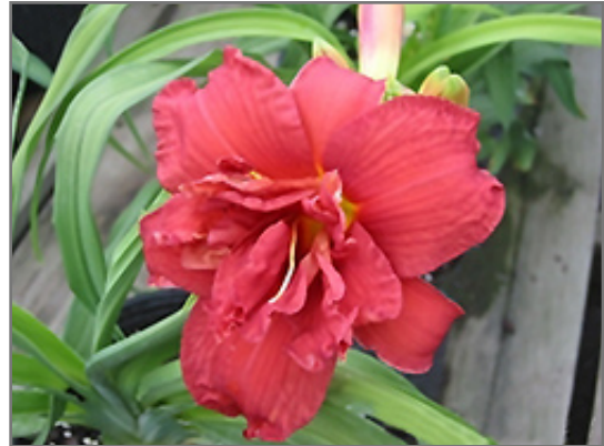
Double Firecracker Daylily flowers