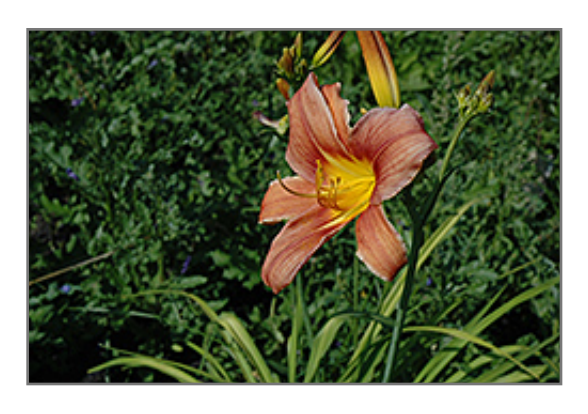
Dolly Varden Daylily flowers