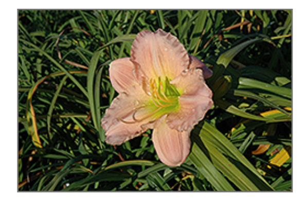
Dallas Star Daylily flowers