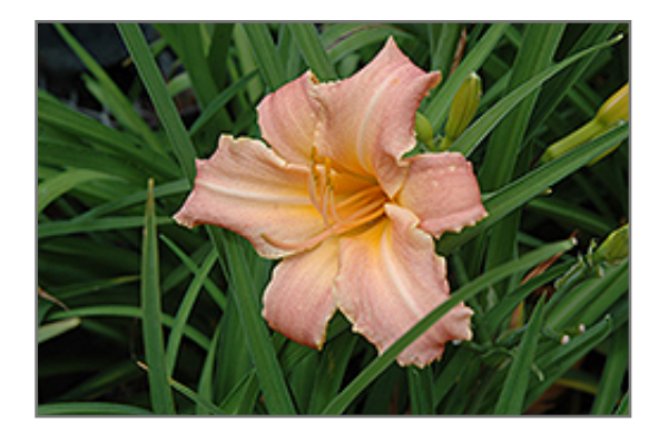
Children's Festival Daylily flowers