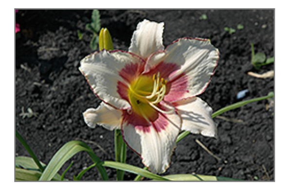
Chicago Picotee Memories Daylily flowers