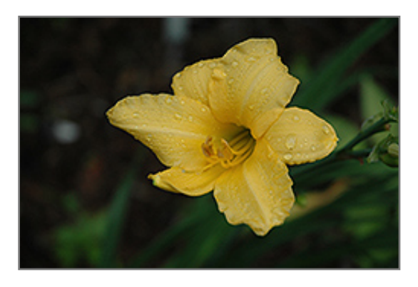
Caprician Honey Gold Daylily flowers