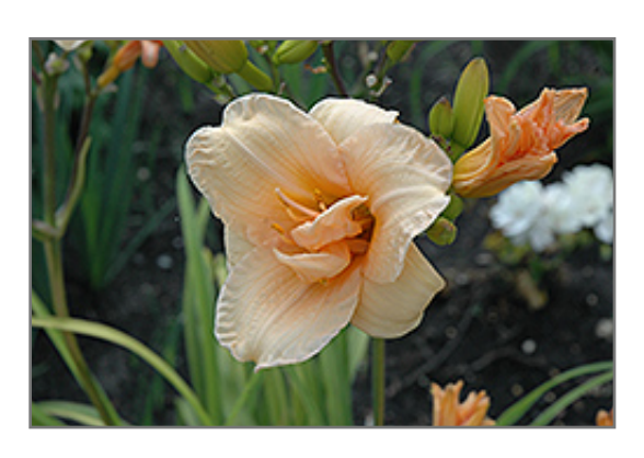
Bubbly Daylily flowers