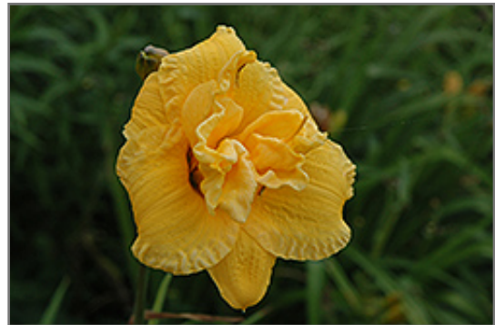
Double Dream Daylily flowers