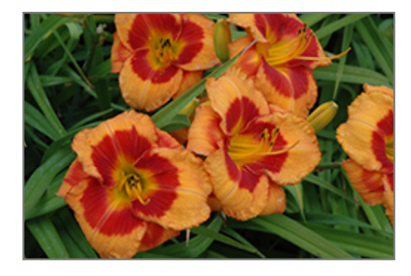
Bold Tiger Daylily flowers