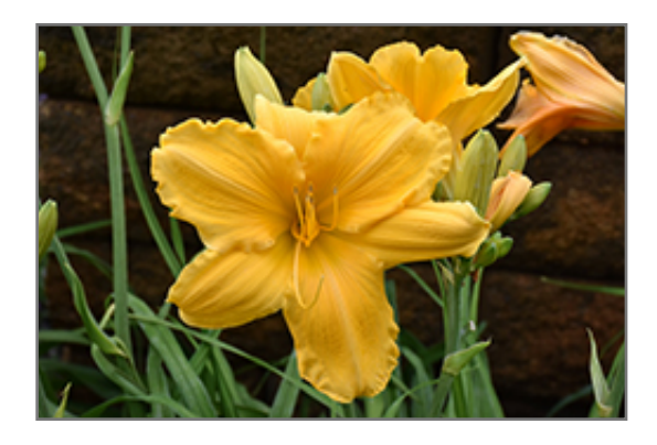
Bodacious Returns Daylily flowers