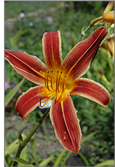
Aabachee Daylily flowers