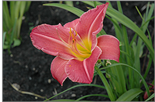
Anne Kelly Daylily flowers