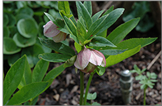
Blackthorn Hybrid Hellebore flowers