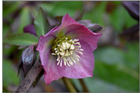
Red Lady Hellebore flowers

Red Lady Hellebore is recommended for the following landscape applications;