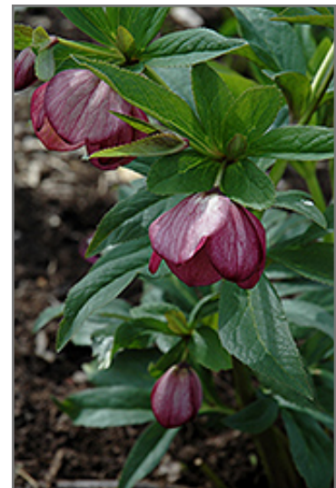
Red Lady Hellebore flowers