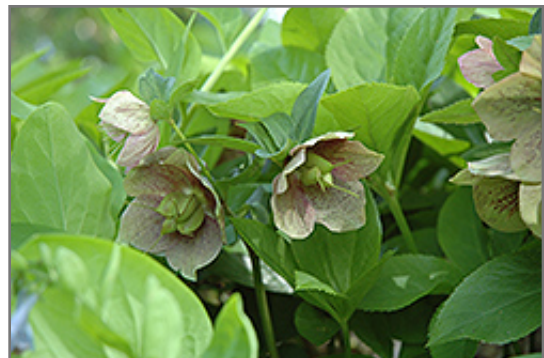
Oriental Hellebore flowers