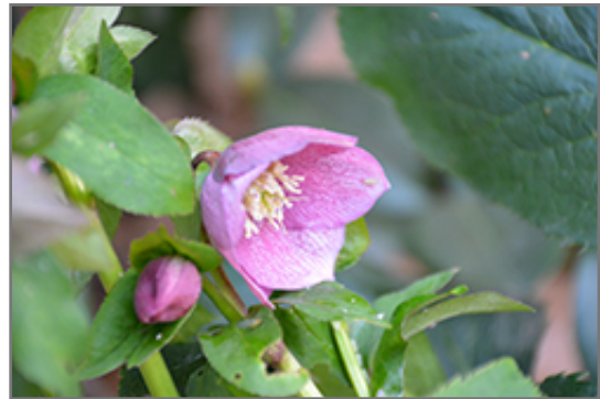
Oriental Hellebore flowers

Oriental Hellebore is recommended for the following landscape applications;