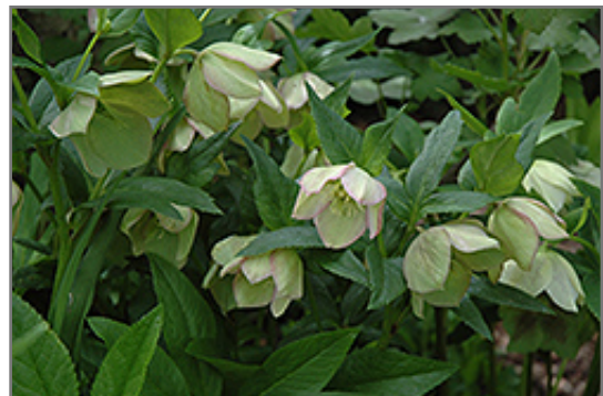
Christmas Rose flowers