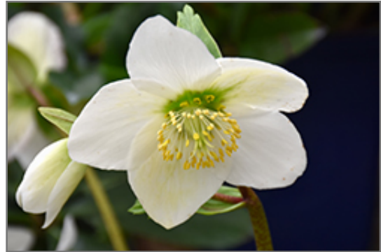
Christmas Rose flowers

Christmas Rose is recommended for the following landscape applications;