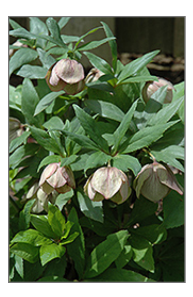
Sopron Hellebore flowers

Buttercup-type dangling clusters of flowers are small and chartreuse colored, emerge in late winter and spring, one of the first flowers to come up in cool weather and a harbinger of spring; attractive metallic blue-green leaves, has a fetid odor