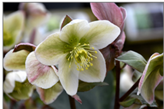
Ivory Prince Hellebore flowers