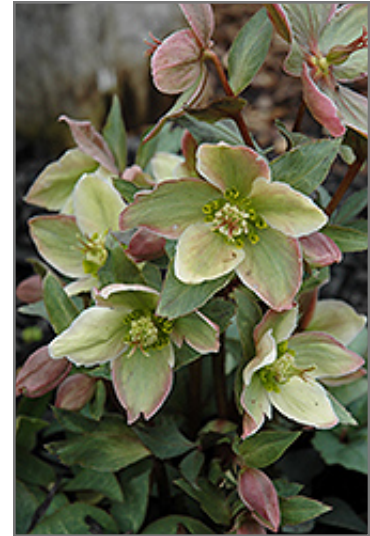
Ivory Prince Hellebore flowers

Ivory Prince Hellebore is recommended for the following landscape applications;