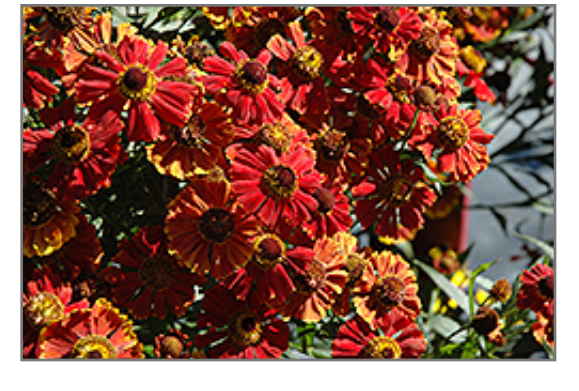
Helena Mix Sneezeweed flowers