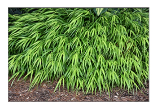
All Gold Hakone Grass foliage

All Gold Hakone Grass is recommended for the following landscape applications;