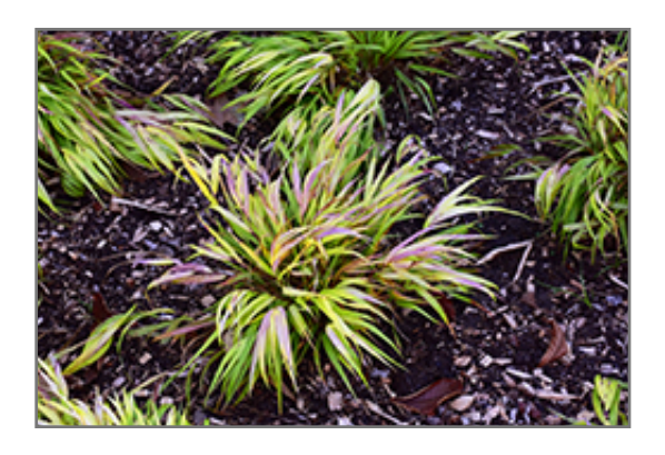
All Gold Hakone Grass in fall

All Gold Hakone Grass will grow to be about 18 inches tall at maturity, with a spread of 24 inches. Its foliage tends to remain dense right to the ground, not requiring facer plants in front. It grows at a slow rate, and under ideal conditions can be expected to live for approximately 15 years. As an herbaceous perennial, this plant will usually die back to the crown each winter, and will regrow from the base each spring. Be careful not to disturb the crown in late winter when it may not be readily seen!