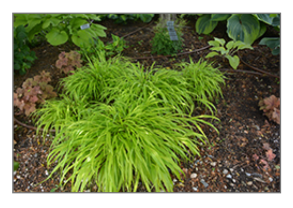
All Gold Hakone Grass