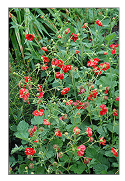
Blazing Sunset Avens in bloom