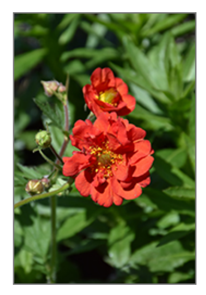
Blazing Sunset Avens flowers

Blazing Sunset Avens is recommended for the following landscape applications;