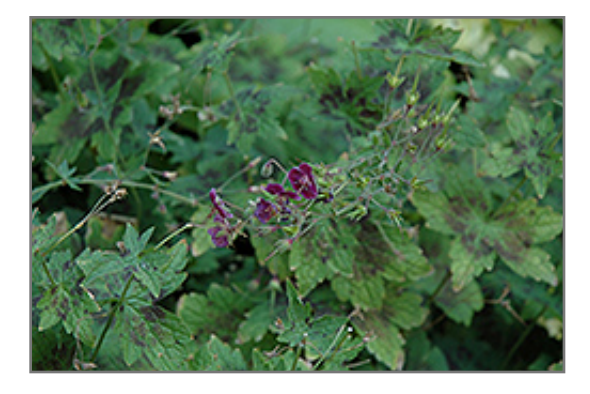
Mourning Widow Cranesbill flowers

Mourning Widow Cranesbill is recommended for the following landscape applications;