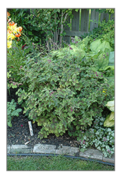
Mourning Widow Cranesbill