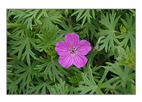
Tiny Monster Cranesbill flowers

This mounded perennial is drenched in saucer shaped violet-purple flowers with dark-purple veins; deadhead spent flowers for reblooming later in the season; foliage takes on scarlet tinges in fall