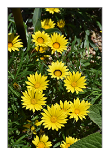
Colorado Gold Gazania flowers

Colorado Gold Gazania is recommended for the following landscape applications;