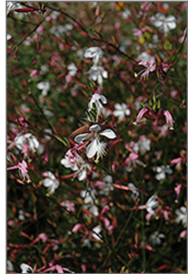
Snowstorm Gaura flowers

This is a relatively low maintenance plant, and is best cleaned up in early spring before it resumes active growth for the season. It is a good choice for attracting butterflies to your yard, but is not particularly attractive to deer who tend to leave it alone in favor of tastier treats. It has no significant negative characteristics.