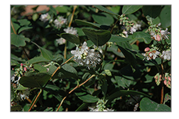
Snowberry flowers

This shrub performs well in both full sun and full shade. It is very adaptable to both dry and moist locations, and should do just fine under average home landscape conditions. It is not particular as to soil type or pH. It is somewhat tolerant of urban pollution. This species is native to parts of North America.