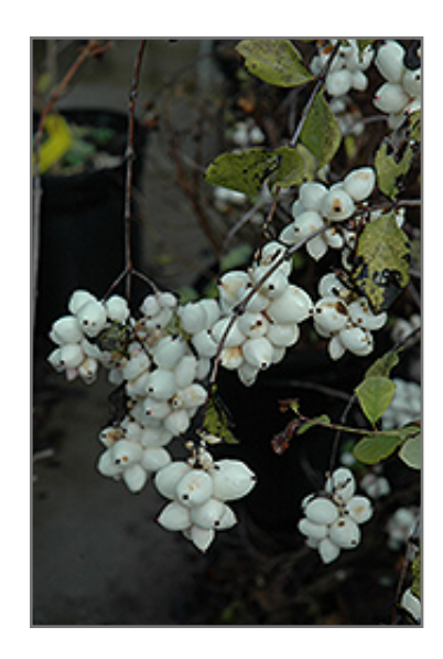
Snowberry fruit

Snowberry is recommended for the following landscape applications;