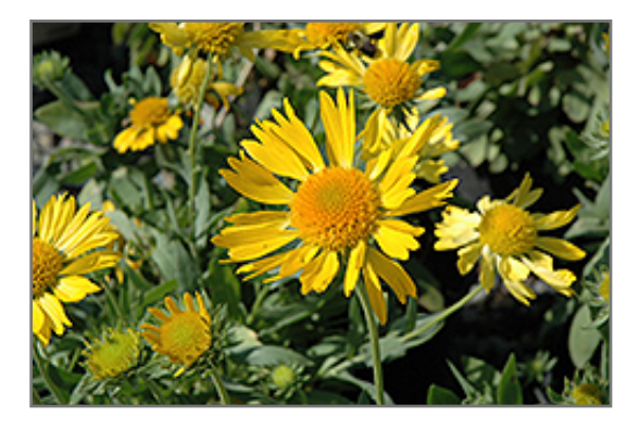
Sunburst Yellow Blanket Flower flowers