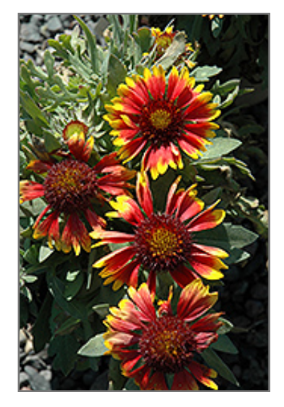
Bijou Blanket Flower flowers

Dwarf hybrid has cheerful tomato-red daisy-like flowers with black-red center and petals tipped with gold; prefers moist, rich sites but will adapt to dry sites; good for naturalizing