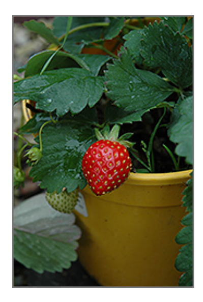
Kent Strawberry fruit

Kent Strawberry features dainty white daisy flowers with yellow eyes along the stems in mid spring. Its tomentose round compound leaves remain green in colour throughout the season. It features an abundance of magnificent cherry red berries from late spring to early summer.