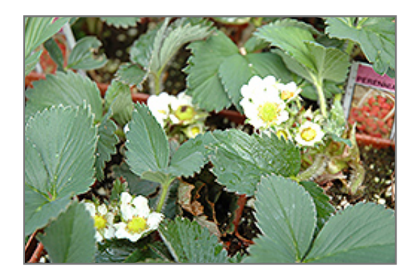
Kent Strawberry flowers