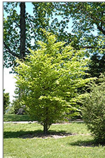
Golden Beech

Golden Beech is recommended for the following landscape applications;