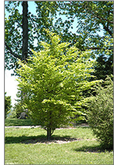
Golden Beech

Golden Beech is recommended for the following landscape applications;