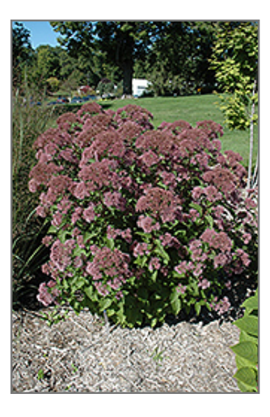
Little Joe Dwarf Joe Pye Weed in bloom

Compact growth habit compared to the species, ideal for smaller gardens; features fluffy plumes of mauve-pink flowers, attractive leaves and strong stems; tasty seeds for birds and nectar for butterflies